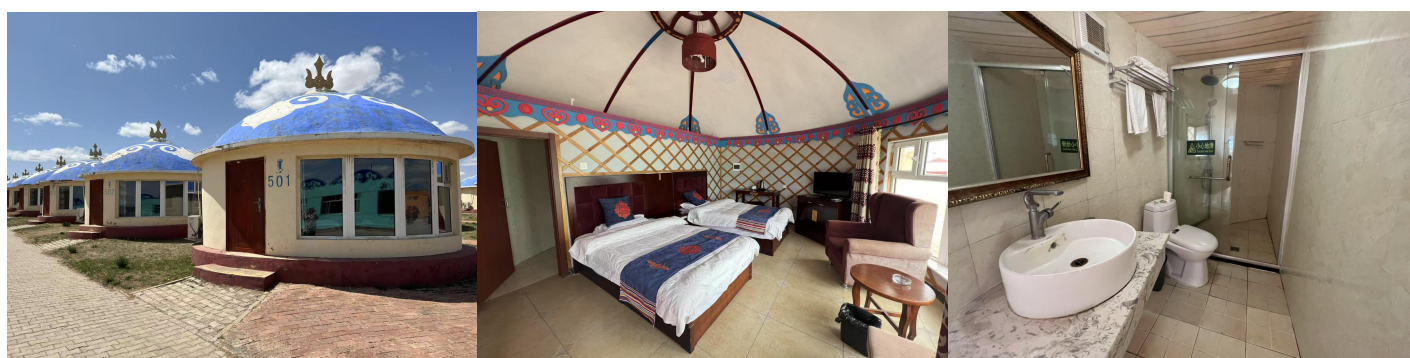
D2 Local Mongolian Tent (No triple room available) "For reference only."