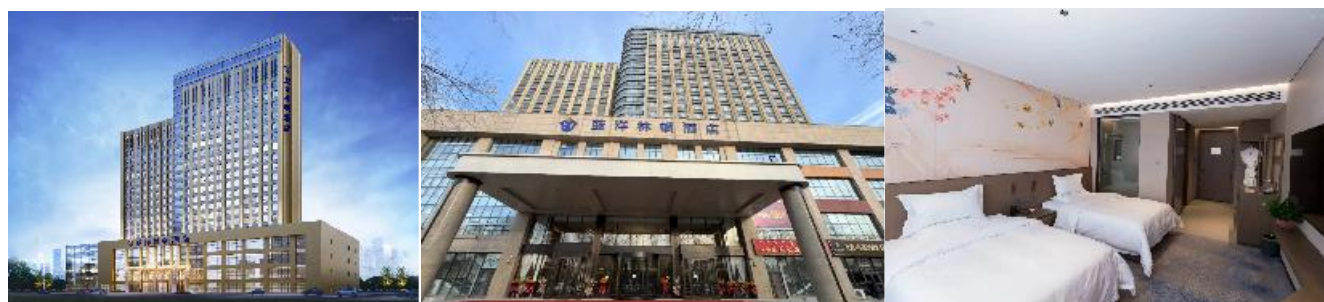
D5-D6 5*Lanyang Lindun Hotel (No triple room available) (33 Sqm)