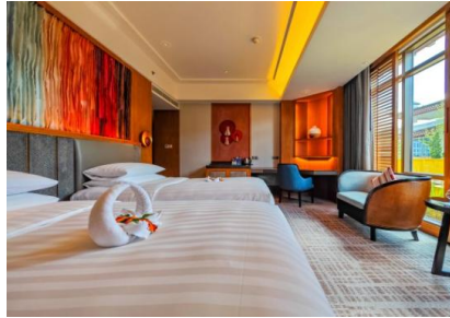
Iridescent Clouds Hotel-25sqm