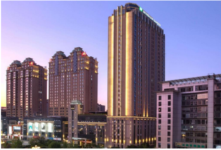
Wyndham Garden Kunming High-Tech Zone-35sqm