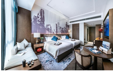
Wyndham Garden Chuxiong Downtown-37sqm