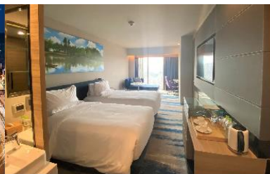
5*Novotel Hanoi Thai Ha(31sqm) – Hanoi