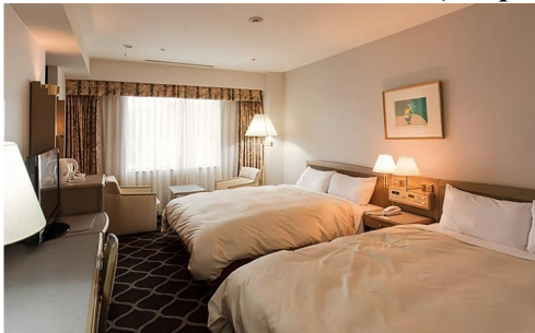
4* Hotel Grand Terrace Chitose (21sqm)