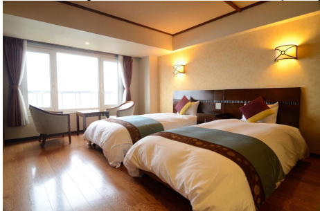
4* Toya Manseikaku Hotel (27sqm)