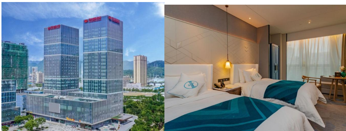
Local5*Xiangxi Sunshine International Hotel