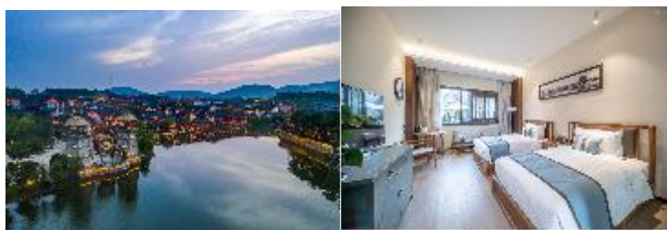
Songguili Hotel of Maoshan Oriental Salt Lake City