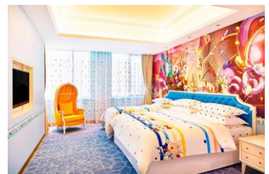
5*Sheraton Hotel-43 m²