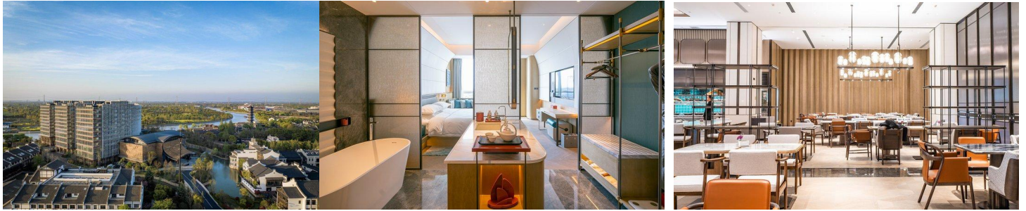
Dishang Resort Hotel-42 Sqm