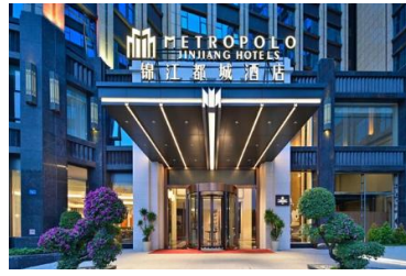
Jinjiang Metropolo Hotel Quanzhou Jinjiang Sunshine Plaza Airport