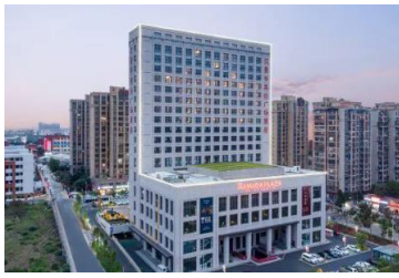
Ramada Plaza by Wyndham Xiamen